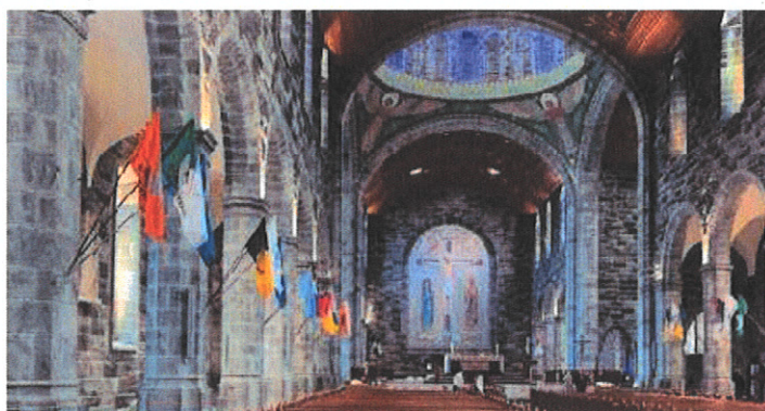
Galway Cathedral County and Diocesan Flags

Preservation Society Fundraising Project A Destination Parish Enhancement