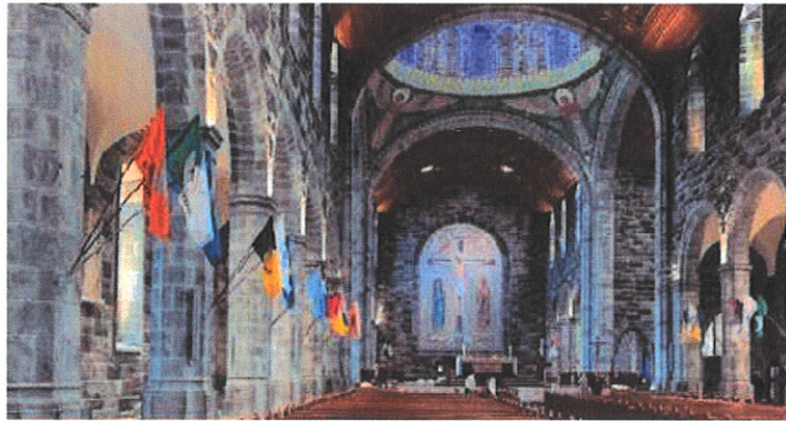
Galway Cathedral County and Diocesan Flags

Preservation Society Fundraising Project A Destination Parish Enhancement